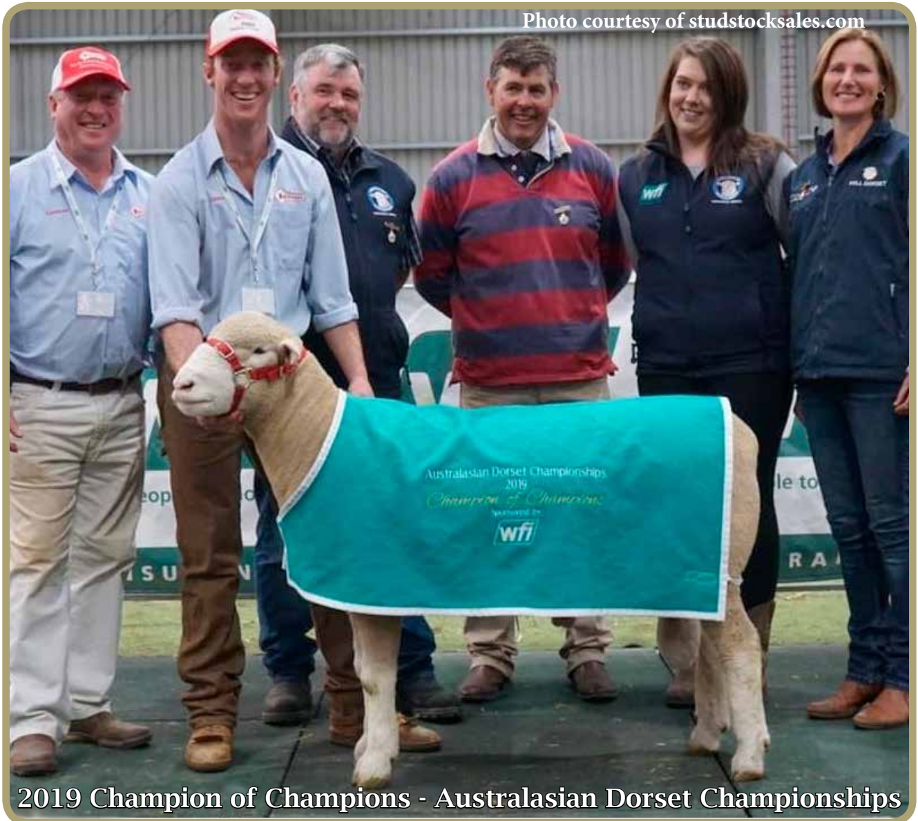
2019 Champion of Champions - Australasian Dorset Championships