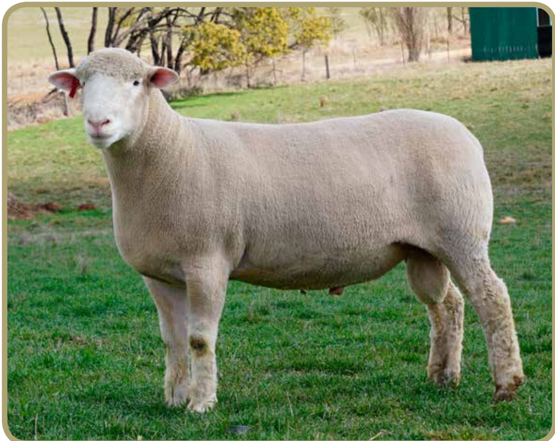
170363 2 Daughters and 4 Sons represented