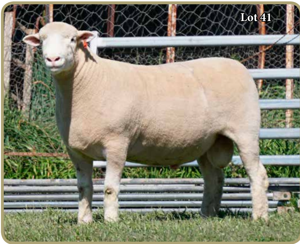
190044 Sire: 170363 Born: April Scan 29/8/20 Wt 137kgs Fat 9mm EMD 64mm EMW 109mm EMA 53.71cm 2 Used in Stud