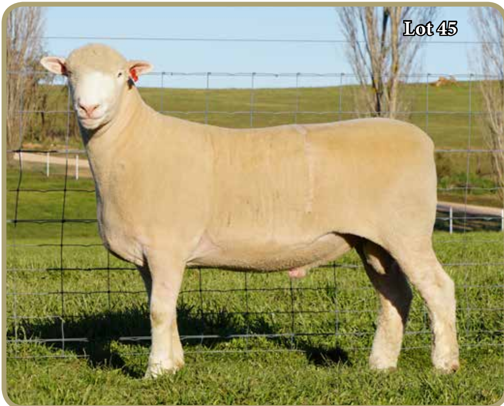
AI 190530 Sire: "Masterstroke" Born: August Scan 29/8/20 Wt 121kgs Fat 6mm EMD 52mm EMW 101mm EMA 40.44cm 2