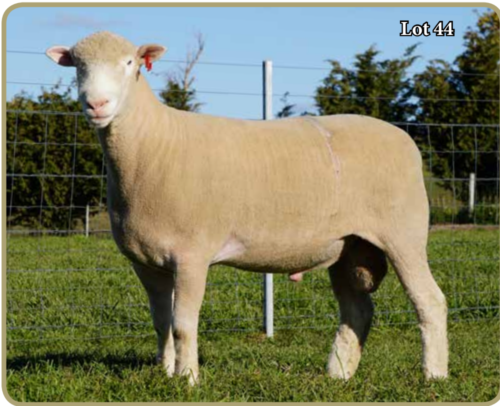
AI 190523 Sire: "Checkmate" Born: August Scan 29/8/20 Wt 130kgs Fat 6 mm EMD 53mm EMW 103mm EMA 42.03cm 2